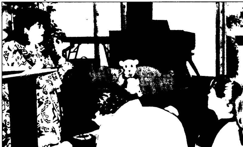
Friday evening Leader's orientation. Everything you need to know about the GOOD NEWS BEARS CLUB.