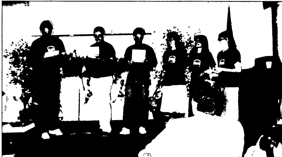
Happenin' Rappin' BEARS Leaders!

Does this here club have a name? Something we all can share? Why, yes, in fact from this day on It's called the GOOD NEWS BEARS!