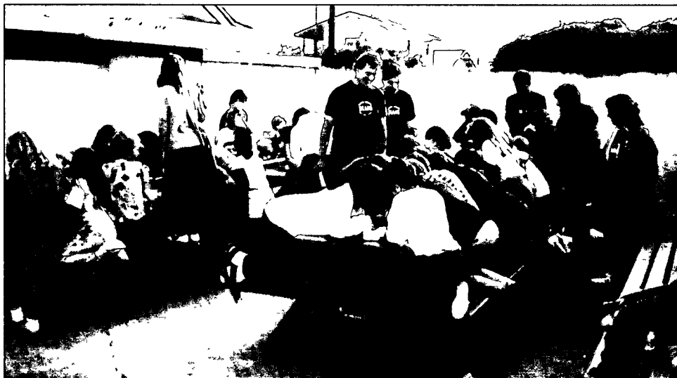
"Can you believe the ice cream that kid is inhaling!!!"