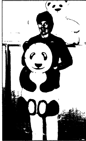
Cathy Omdal (Tim Omdal not shown)